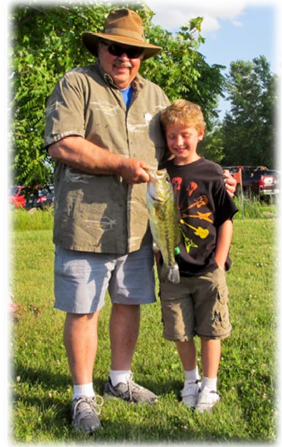
Kids' Fishing Day 2013