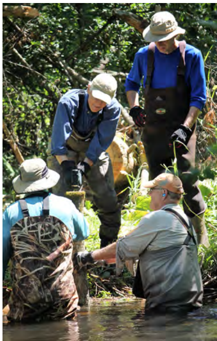
July 15 work day activities on the Pine River.

CWTU BOARD MEETING KAYAK FISHING PRESENTATION BY DAN HARMON III Tuesday, September 12, 2017 6:15 Board Meeting 7:15 Program Fin and Feather 22 W Main St, Winneconne