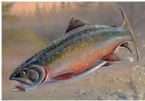
2002 Wisconsin Trout Stamp By Bill Millonig