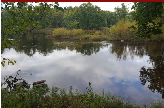
60 Island Area of the Menominee River