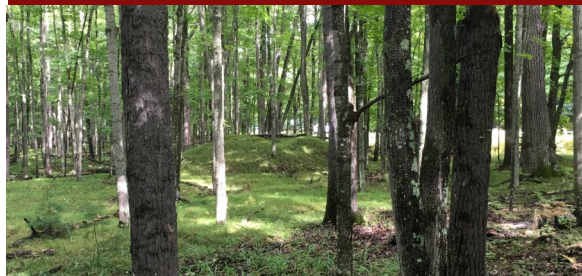
Menominee burial mound within the Backlund Mound Group and Village site